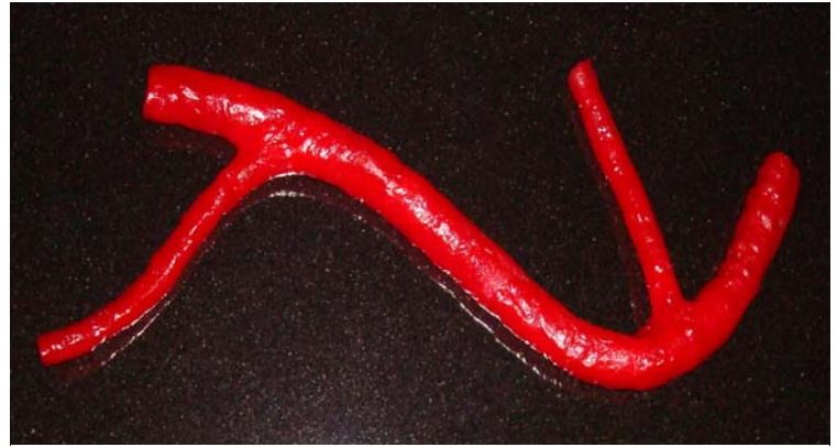
SynDaver™ Labs' synthetic human tissues and body parts offer the first real alternative to live animal and cadaver use.

"When these materials are assembled into an arterial construction, the resulting body part responds to stimulus—a medical device test for example—much like the real article," Sakezles says. This feature enables medical device engineers to evaluate the effects of prototype devices in an environment that resembles end use and is both controllable and reproducible. "This capability is new and does not exist apart from our technology, even with